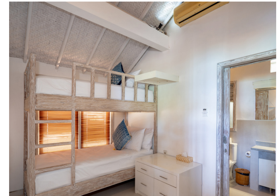
B U N K B E D