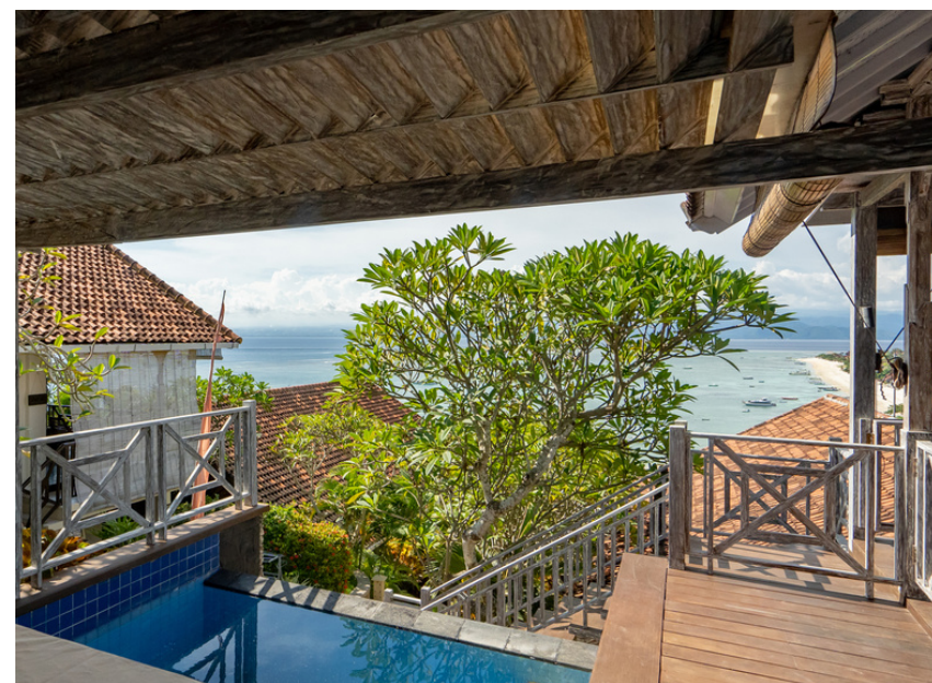
P L U N G E P O O L