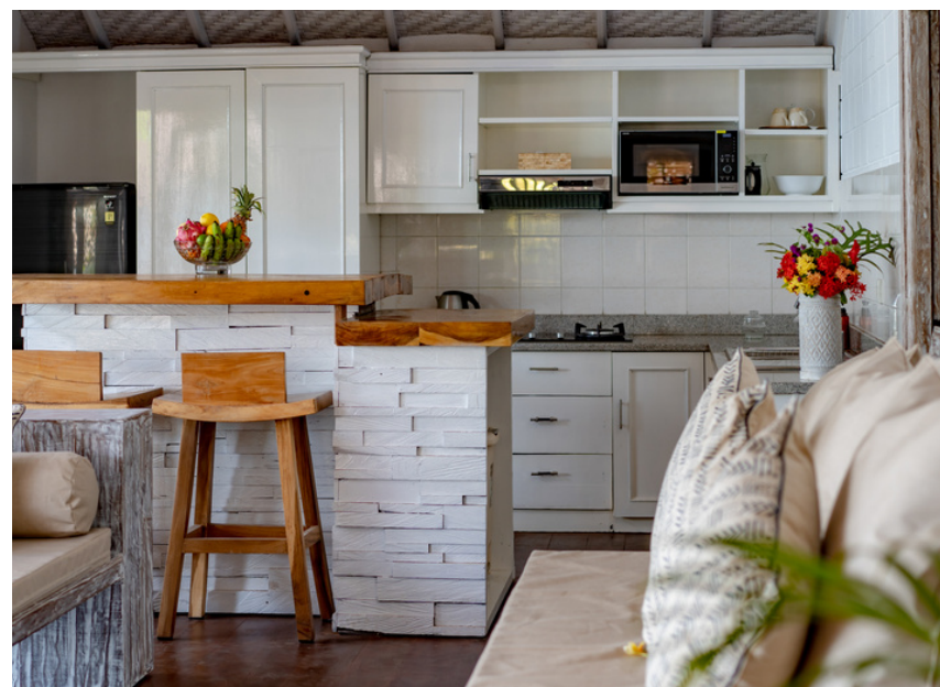
K I T C H E N