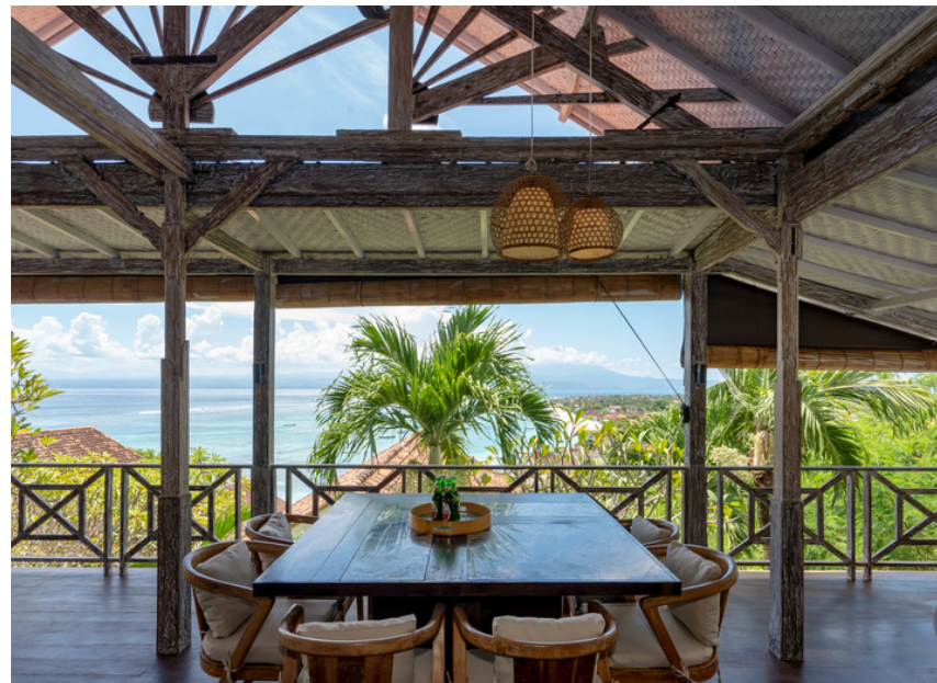
B A L C O N Y