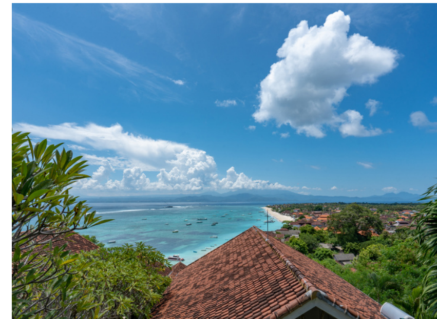
O C E A N V I E W S