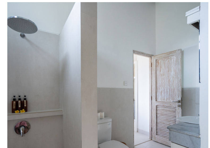
B A T H R O O M