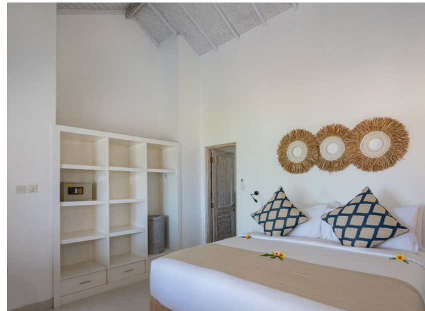
B E D R O O M