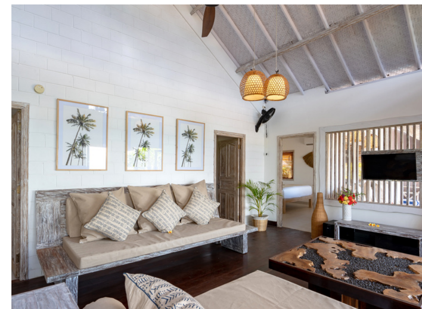
L I V I N G A R E A