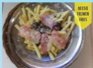
AUSSIE FRENCH FRIES