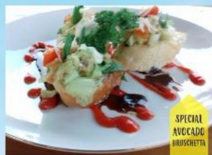
SPECIAL AVOCADO BRUSCHETTA