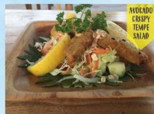
AVOCADO CRISPY TEMPE SALAD